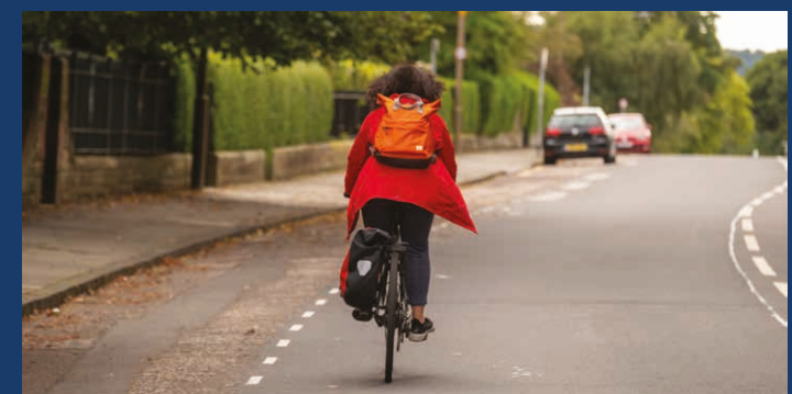
Our analysis of road safety and collision data showed that in collisions between bikes and vehicles, 73% of factors contributing to a collision are assigned to drivers.